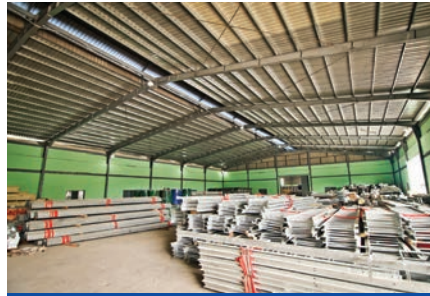
LADDER PARTS AT OUR YANGON FACILITY