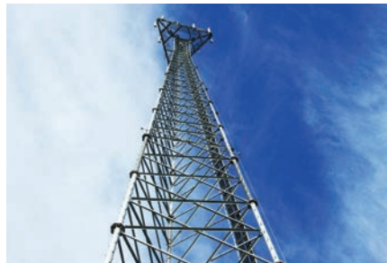
A COMPLETED TOWER IN MYANMAR

CEA PROJECT LOGISTICS G-18 PEARL CONDO KABAR AYE PAGODA ROAD BAHAN TOWNSHIP YANGON MYANMAR +959 421 031 286 www.ceaprojects.com