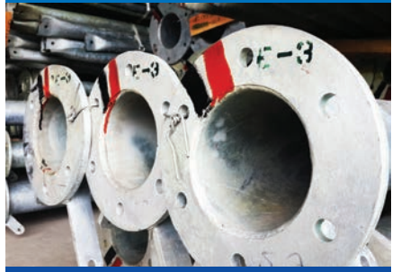
EACH PART IS NUMBERED AND COLOURED