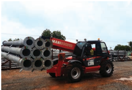
TOWER LEGS GOING INTO OUTSIDE STORAGE