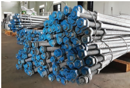
FOUNDATION ANCHOR BOLTS