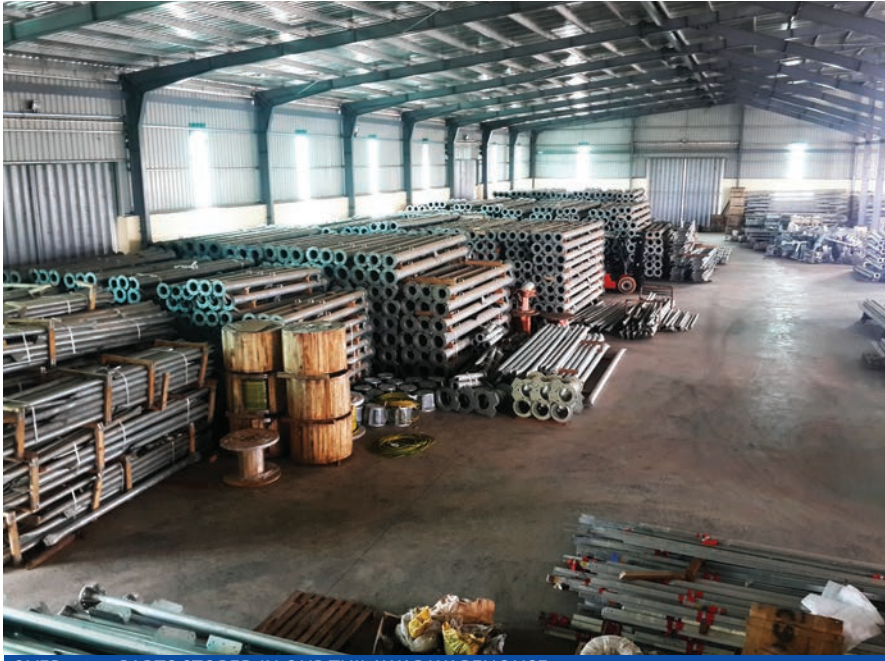
OVER 4,000 PARTS STORED IN OUR THILAWAR WAREHOUSE