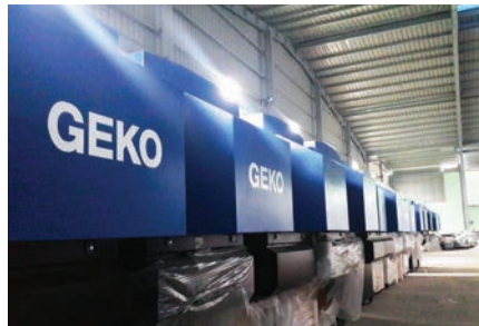
TOWER GENERATOR UNITS