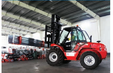
MANITOU EQUIPMENT USED THROUGHOUT