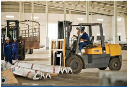
ANGULAR TOWER SECTIONS UNLOADED