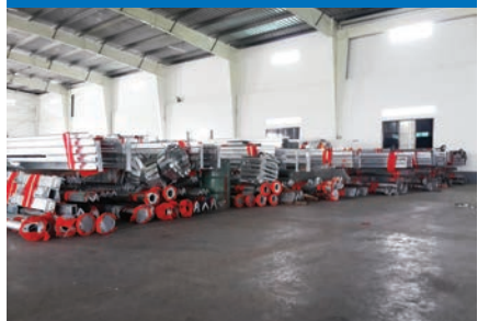
PARTS STORED IN COLOURED SECTIONS