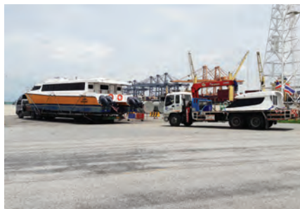
CONVOY ENTERS PORT