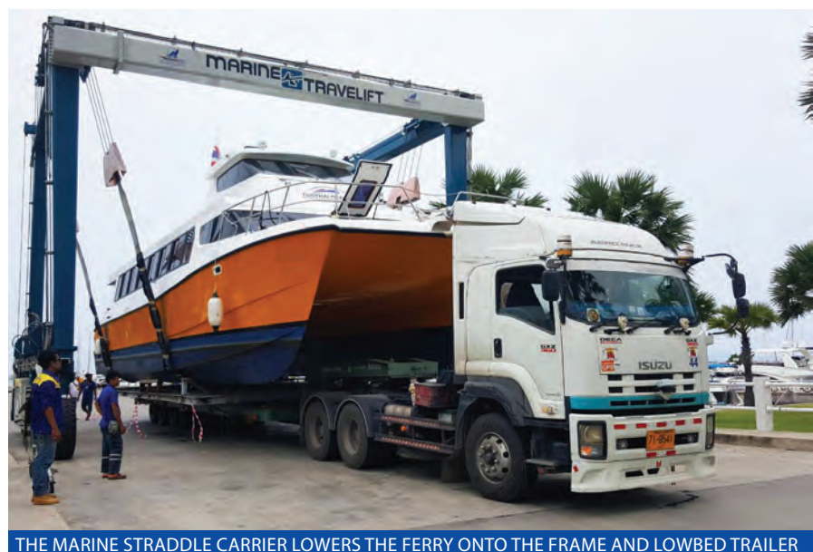
THE MARINE STRADDLE CARRIER LOWERS THE FERRY ONTO THE FRAME AND LOWBED TRAILER

The ferry was moored at Ocean Marina Yacht Club and was lifted from the water by the on-site Marine Straddle Carrier. CEA Teams were on hand to supervise the lift and to execute the lowering and loading onto a specially fabricated frame that was attached to a standard Lowbed trailer.