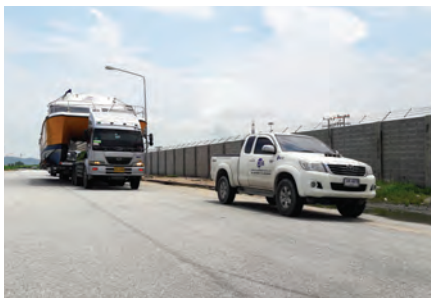
CEA ESCORT VEHICLE LEADS THE CONVOY