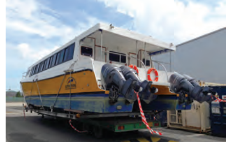
IN STORAGE AT THE CEA FACILITY