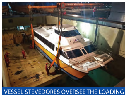
VESSEL STEVEDORES OVERSEE THE LOADING