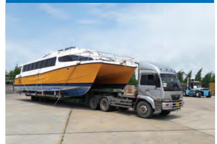
LEAVING THE CEA FACILITY

After seven days in storage, the ferry was transported to Laem Chabang Port under CEA escort and readied for loadout which included the top section being reattached. Port and vessel stevedores executed the loading and stowage aboard the Atlantic Dawn. CEA provided all the necessary shipping and customs documentation in preparation of export.