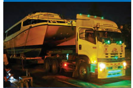
NIGHT TRANSPORT TO THE CEA FACILITY

Due to the height restrictions on the roads the top section of the ferry was removed and loaded onto a separate trailer. After the CEA rigging teams had secured the ferry to the trailer, the prime mover and its cargo began the 33km journey to Laem Chabang. The ferry, upon arrival, was stored at the CEA Free Trade Zone until the shipping vessel Atlantic Dawn arrived.