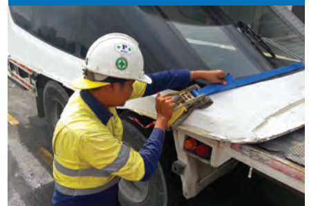
BRIDGE SECTION SECURED ON TRAILER

After seven days in storage, the ferry was transported to Laem Chabang Port under CEA escort and readied for loadout which included the top section being reattached. Port and vessel stevedores executed the loading and stowage aboard the Atlantic Dawn. CEA provided all the necessary shipping and customs documentation in preparation of export.