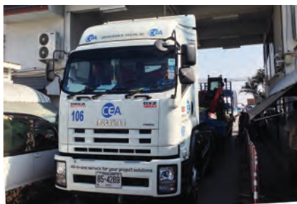
MAE SOD BORDER CROSSING MYANMAR

CEA offer the flexibility of new routes to all our clients, additionally we provide visibility, security, extra capacity and the option of multi-modal transportation for finished goods, machinery, raw materials, gases and chemicals. Consolidation services are also offered at our logistics base in Laem Chabang, Thailand.