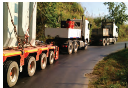
CEA CONVOY HEADING INTO LAOS