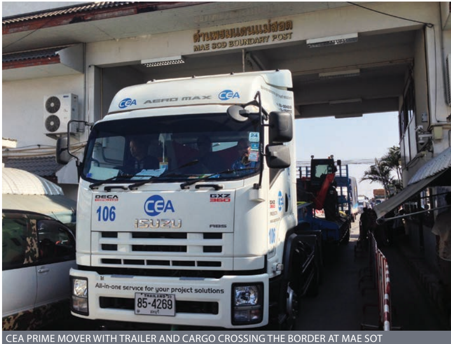
CEA PRIME MOVER WITH TRAILER AND CARGO CROSSING THE BORDER AT MAE SOT

Regular road services connect Myanmar and Thailand enabling us to make substantial savings for our clients when compared to Air Freight Transportation. Our fleet includes an In-Vehicle Management System (IVMS) giving the customer greater insight and control.