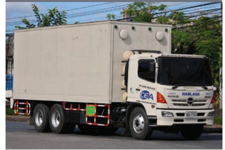
CROSS BORDER LCL SHIPMENTS AVAILABLE