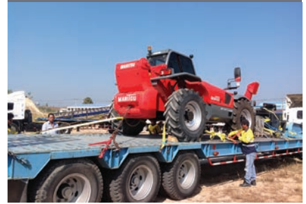
UNLOADING OVER THE BORDER IN YANGON