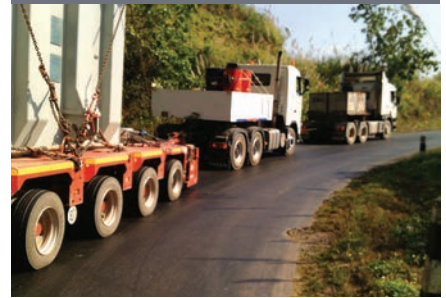
CONVOYS LEAVE DAILY FROM BOTH SIDES