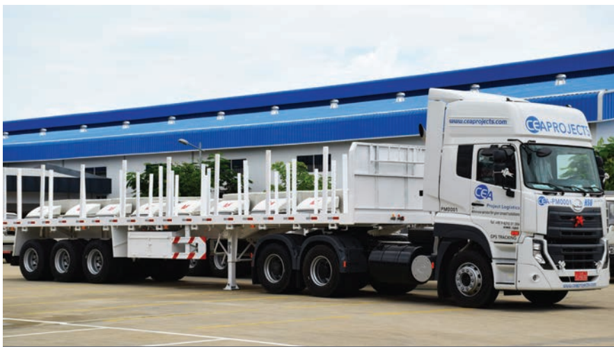
TWO UD 420 QUESTER PRIME MOVERS HAVE BEEN ADDED TO THE CROSS BORDER FLEET

With years of experience both domestically and internationally, CEA is well-versed with the logistics involved in transportation across borders within the ASEAN region.