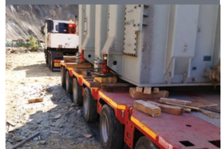
MULTI-AXLE TRAILERS ARE AVAILABLE

CEA PROJECT LOGISTICS G-18 PEARL CONDO KABAR AYE PAGODA ROAD BAHAN TOWNSHIP YANGON MYANMAR +959 421 031 286 www.ceaprojects.com