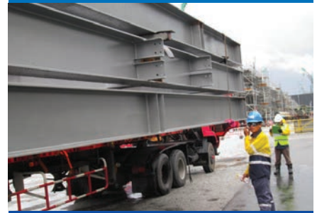
STEEL ENROUTE TO THE CEA FACILITY