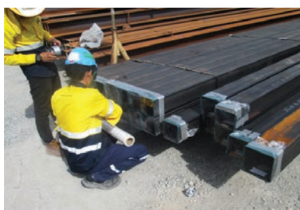
STEEL PREPARED FOR QUARANTINE

With over 160,000 m 2 of storage space and options of Free Zone and General Storage solutions coupled with expansive yards and customisable warehouses, we are strategically placed to offer our clients a valued solution.