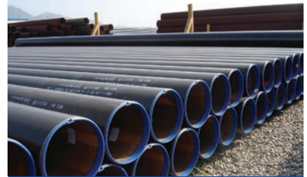
STEEL PIPES IN STORAGE AT AO UDOM