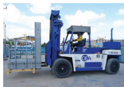
CEA 32T FORKLIFT