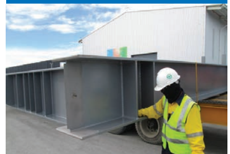
ALL CARGO IS INSPECTED ON ARRIVAL