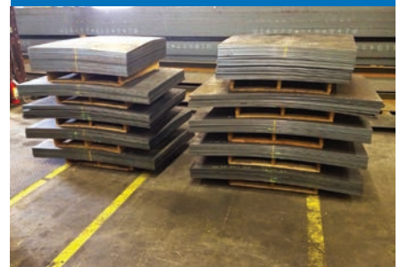
STEEL PLATES STORED AT OUR WAREHOUSE