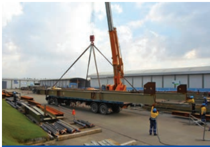
LOADING AT NASCO HIAP SENG

CEA provided a total logistics supply chain solution for the shipping, customs clearance, handling and bulk storage of pipe, flange connections, structural steel and plate of approximately 30,000 RT. Materials were stored at our facility under 24 hour security. All materials were delivered to our customer's fabrication facility in accordance with their MTO requests. Stock inventories were maintained using our materials management software.