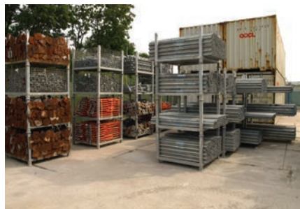
VARYING STEEL PARTS IN STORAGE

CEA PROJECT LOGISTICS 41/13 M1 AO-UDOM ROAD TUNGSUNGKHLA SRI RACHA CHONBURI 20230 THAILAND +66 38 354 019 www.ceaprojects.com