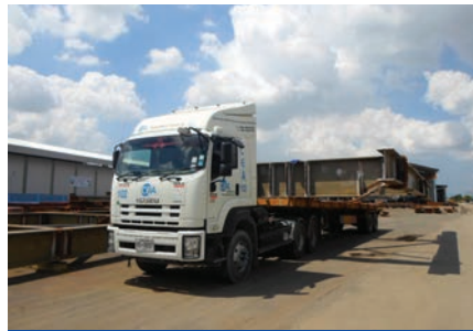
CEA VEHICLES USED FOR TRANSPORTATION