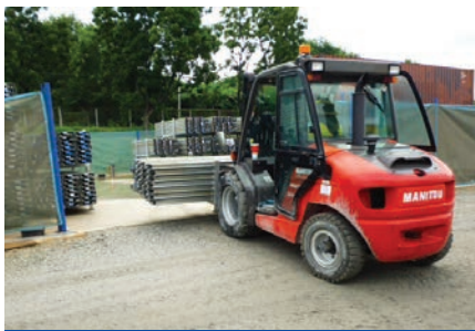
MANITOU MHE USED THROUGHOUT CEA

CEA provided receipt under vessels hook of 60,000 tons of structural steel and pipe for the QCLNG module fabrications in Laem Chabang. CEA's scope was to receive the cargo on multiple charter shipment and containerised cargo, provide customs clearance, transportation to site and offloading to Bechtel's laydown yard. The total project duration was approximately 18 months.