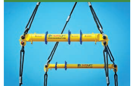
SURELIFT BEAMS IN ACTION

CEA PROJECT LOGISTICS 41/13 M1 AO-UDOM ROAD TUNGSUNGKHLA SRI RACHA CHONBURI 20230 THAILAND +66 38 354 019 www.ceaprojects.com