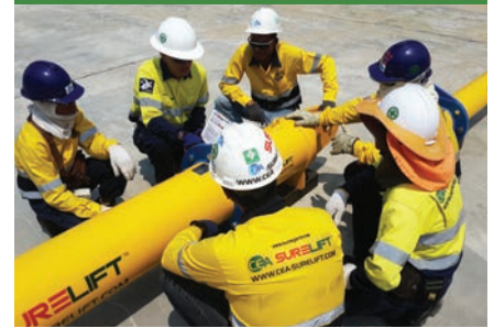
SURELIFT OFFERS ON/OFFSITE TRAINING