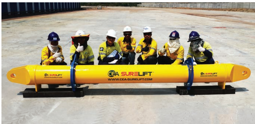
DESIGNED BY EXPERIENCED ENGINEERS FOR LIFTING PROFESSIONALS