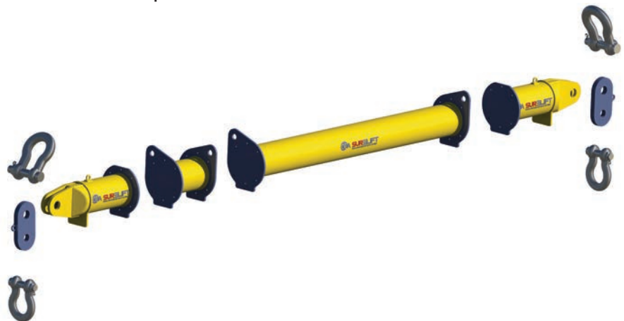
EXPLODED VIEW OF A SL 110 WITH ALL IT'S COMPONENTS

CEA Engineering have designed the beams to meet the requirements of the Machinery Directive in Europe ensuring that the beam components have lifting points to protect them from damage. Additionally the beams are designed to have a higher ground clearance to make their assembly easier, each beam is sold with its own torque wrench.