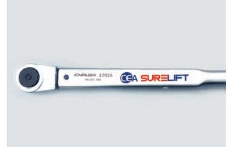
TORQUE WRENCH INCLUDED WITH BEAMS