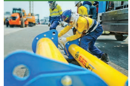
GREAT DESIGN MEANS EASY ASSEMBLY